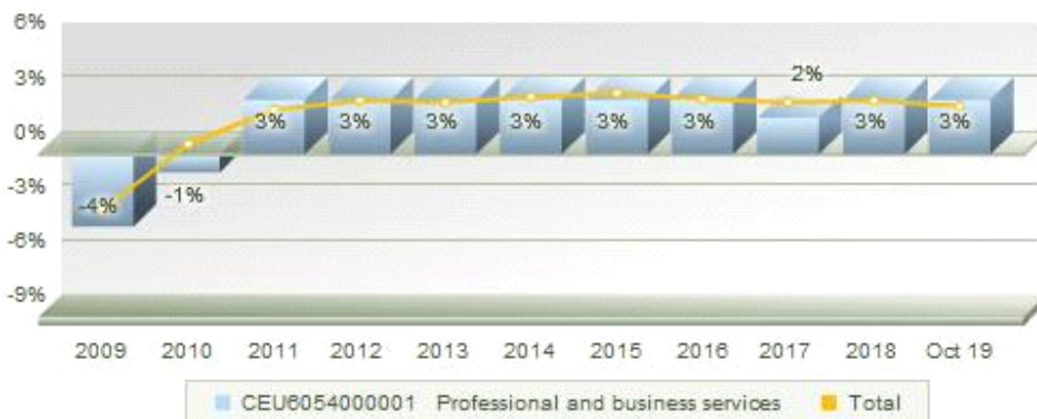
Industry Employment Growth Bureau of Labor Statistics

Professionals can earn high salaries because of their expertise; support staff are paid less. Wages vary among industry sectors. The average hourly wage for the professional services sector overall is significantly higher than the US average. The injury rate for the industry is about 50% lower than the US average.